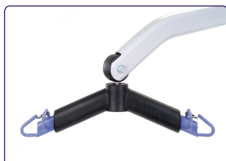
6-point spreader bar

The Presence can also be fitted with an optional digital weigh-scale device providing an accurate measurement of weight for on-going patient observation. This weigh-scale is extremely compact and has a dual screen display for ease of use.