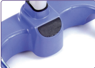
Foot 'push pad' helps reduce the force needed to initiate forward movement.