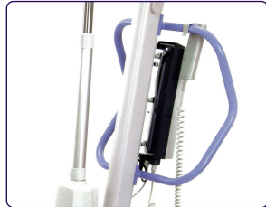
Over-sized push handle for improved handling and manoeuvrability.