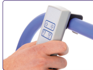
Hand control clip ensures convenient storage when not in use.