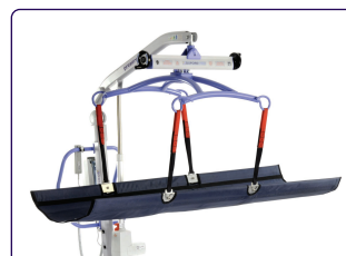
6-point adjustment cradle for use with a stretcher