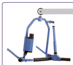
Manual or powered 4-point cradles